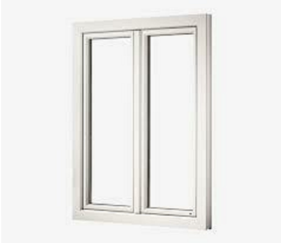
4- WHITE POWDERCOATED ALUMINIUM FRAME GLAZED DOORS & WINDOWS