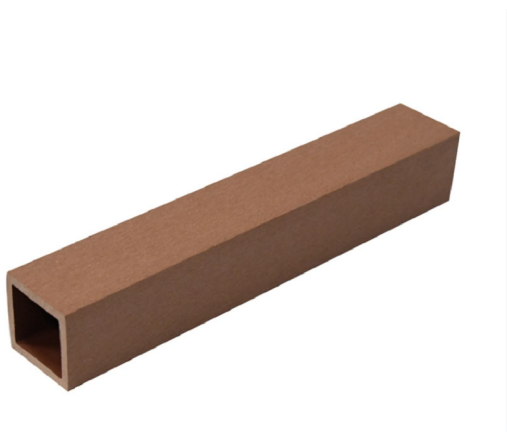
3- SELECTED TIMBER COLUMN